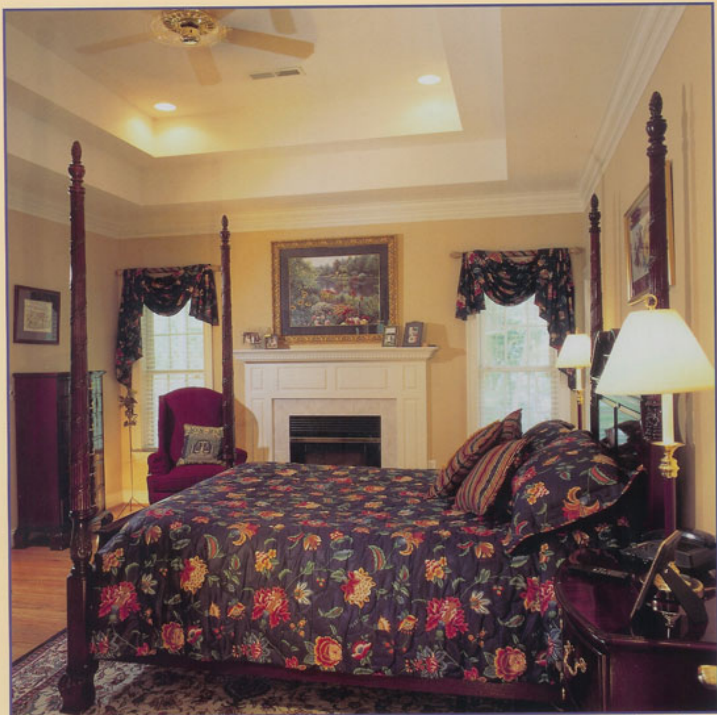
Crown molding and a boxed tray ceiling distinguish this formal bedroom, which also features hardwood floors by Jordan Lumber Company. The gas fireplace is by Thulman Eastern, marble surround by Moon's Tile.

but we're always there to help each other out," says Frank.