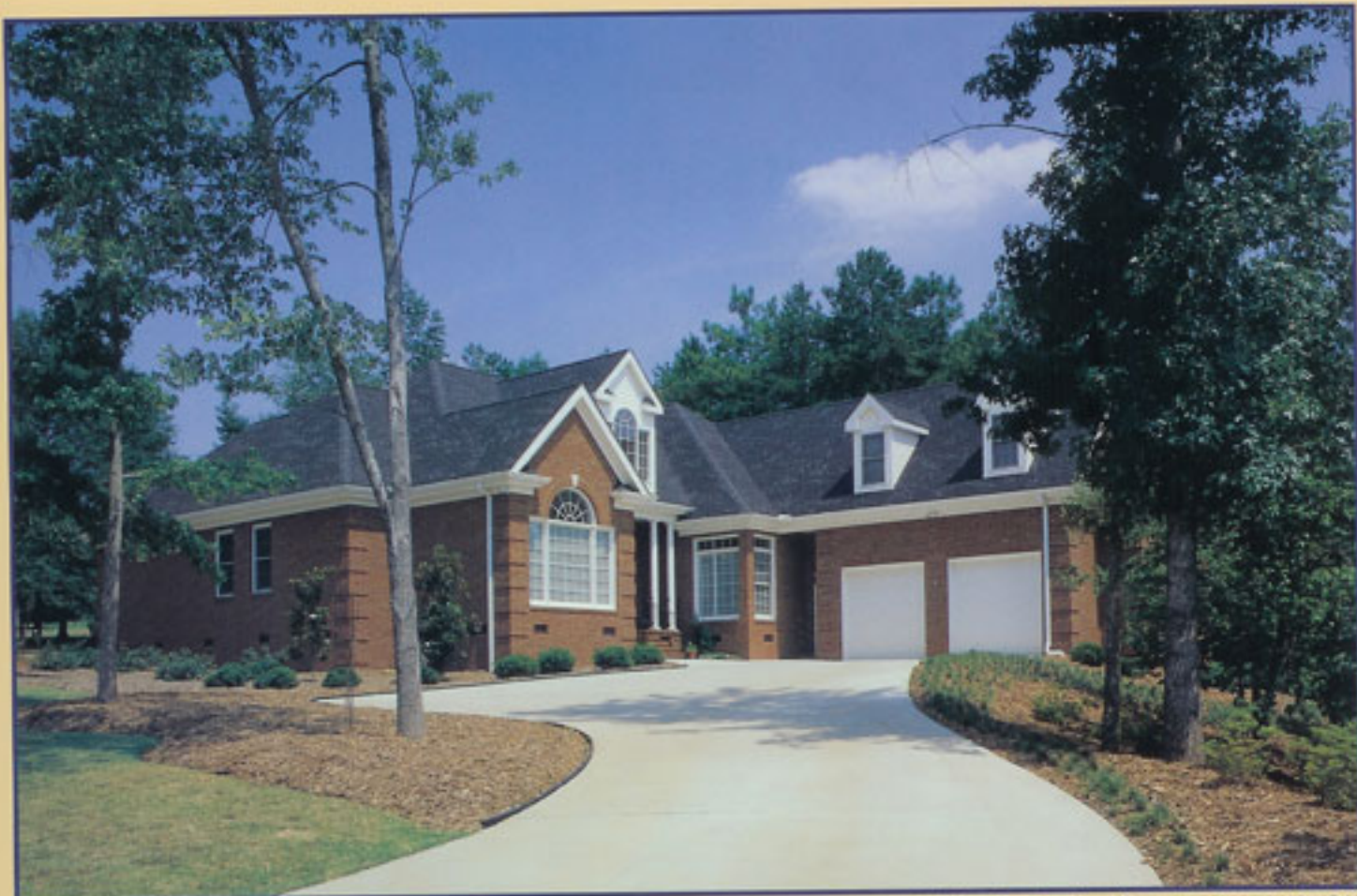
Comfortable brick homes line the wooded streets of Kings Grant subdivision. Here, the garage doors by Wayne's Overhead Doors, landscaping by S.K. Busby, HVAC in all Turner homes is provided by McAlister Heating and Air.

the number of homes that other companies do, but what we do build is built the right way without cutting any corners."